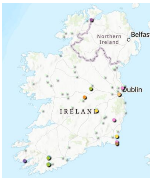
Figure 1 detailing the cases of HPAI detected in wild birds in Ireland in 2025 (as of 07/04/2025)